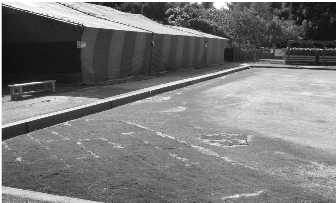
Work is progressing on the clubhouse and the green. Here is the clubhouse festively wrapped while we were bowling at the Friendship Tournament in Santa Clara. The green has been plugged, sanded and sodded in preparation for leveling. We'll have to learn the quirks of the various rinks all over again.